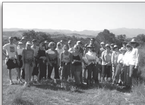
Outdoor Fitness Club Visit