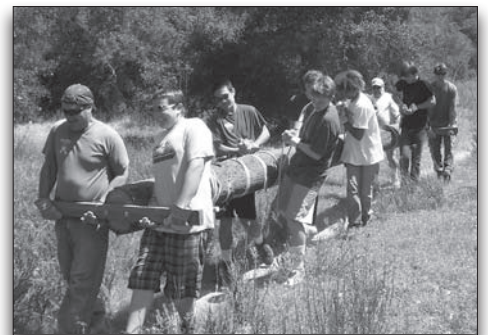
Bridge Construction by Scouts