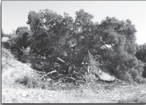
"Mother Oak" – Coast Live Oak Tree