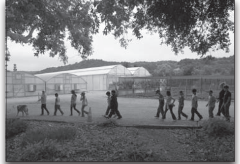
Tree of Life "Sponsor-A-School" Field Trip