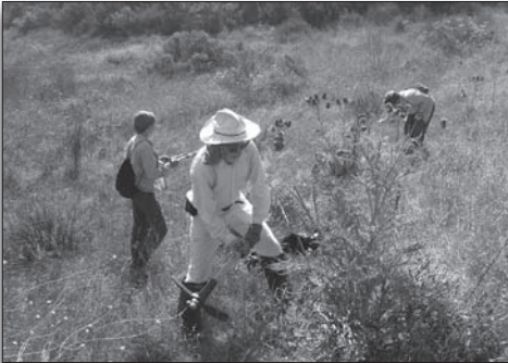
X-treme Weeding (removing artichoke thistle)