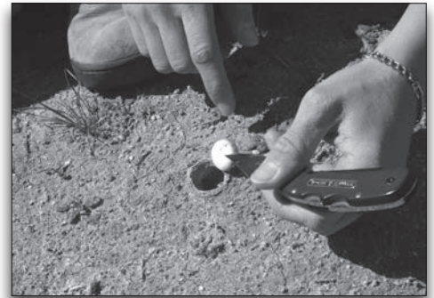
Trap Door Spider