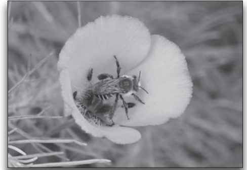
Nectaring a Mariposa Lilly