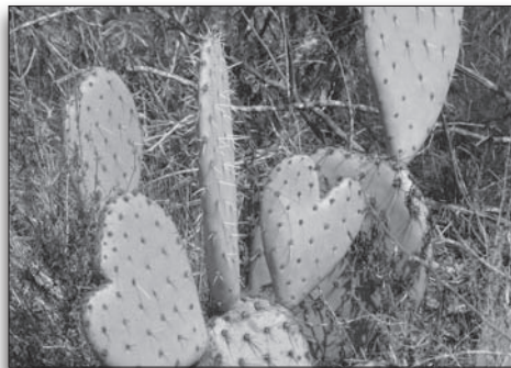
Heart Shaped Cactus